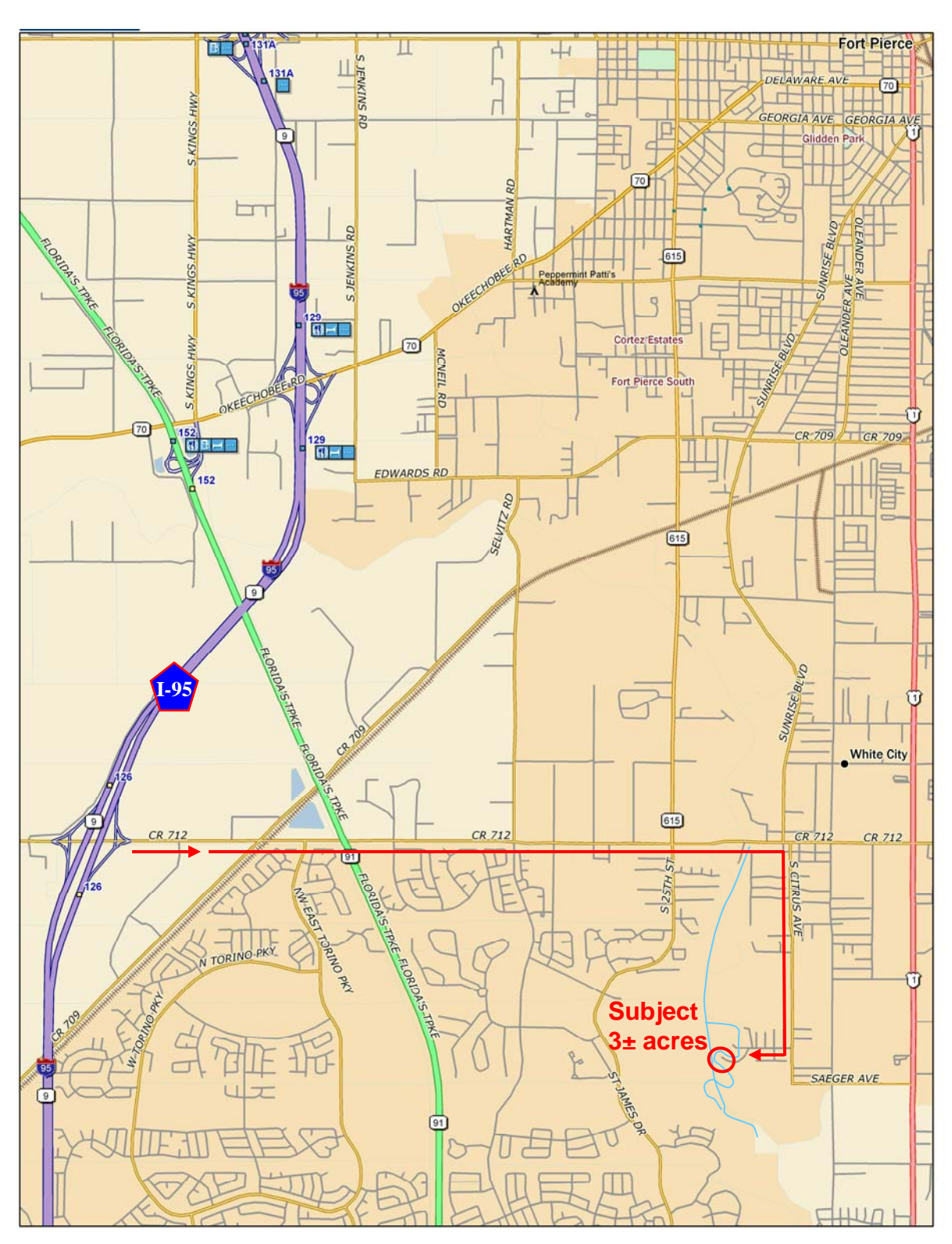
<u>From I-95:</u> Exit #126 / Midway Rd / CR712; go East 4.7 miles to Citrus Ave, then South 5.6 miles to Parkland Dr, then West to Riverland Drive, then South on Private Road to Property.